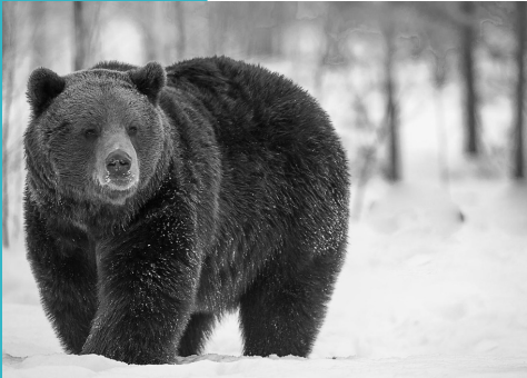
The Finnish bear