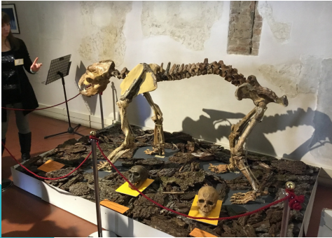
Skeleton reconstruction of a bear found in caves