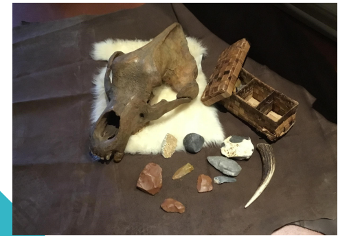
Bones and tools