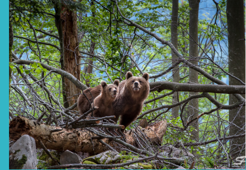
The Slovenian bear