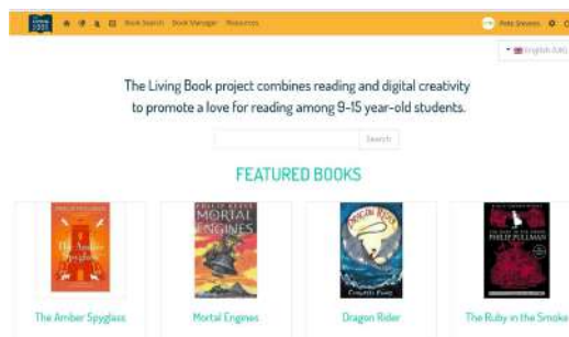
Figure – The Living Library Homepage

To register simply follow this link: www.thelivinglibrary.eu/register